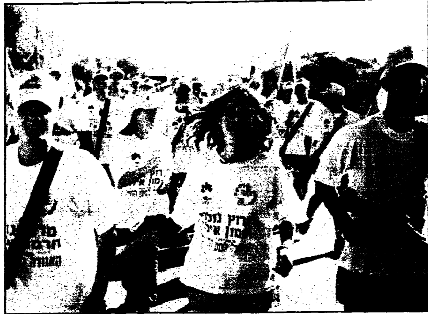
17th Golani Run Golani Brigade soldiers keep up the pace Sunday on their annual Mt. Hermon to Eilat run, which is to end Thursday.